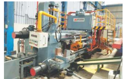
Aluminum Extrusion Press Machine - 1000 MT

Phoenix Alliance has an annual capacity of 3600 MT under one roof with a hydraulic extrusion press of 1000 MT PRESS which is controlled by Microprocessor-based technology and programmable logic control (PLC) system. We have a fully integrated plant with melting and casting facility.