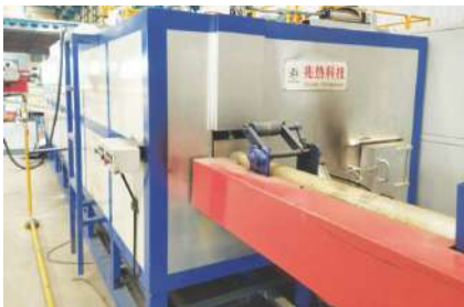
Aluminium Multi Billet Heater

At Phoenix Alliance, we realise that every project is different. To create custom products that better meet your requirements, we have invested in state-of-the-art extrusion press, billet heating, quenching and handling equipment along with enhancing our engineering capabilities. We can produce custom aluminium extrusions with complex multi-void hollow shapes, tight tolerances extruded to your specifications.