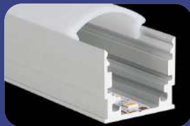
LED AND LIGHTING