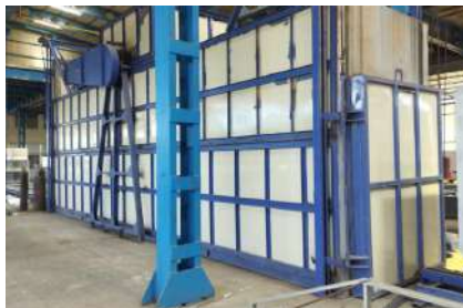
6 Basket Aluminium Ageing Oven